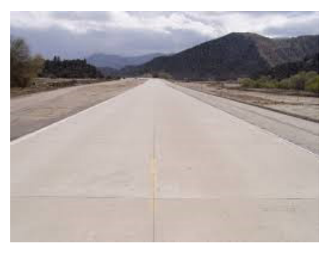
A concrete road

There are various reasons that we would use concrete for these items: