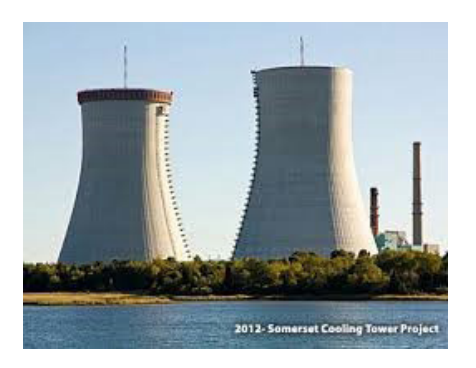
Concrete power station cooling towers