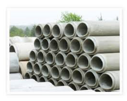
Concrete water pipes